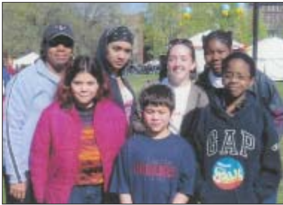
Tenacity students have participated in the Walk for Hunger for the past two years

On May 2 nd , for the second year in a row, a number of Tenacity students participated in Project Bread's Walk For Hunger – a 20 mile walk through the greater Boston area that raises money for families throughout Massachusetts. The students were nervous about the distance when they started, but they all did their best and we were proud of them, not only for their effort the day of the walk, but for their desire to support people in their community.