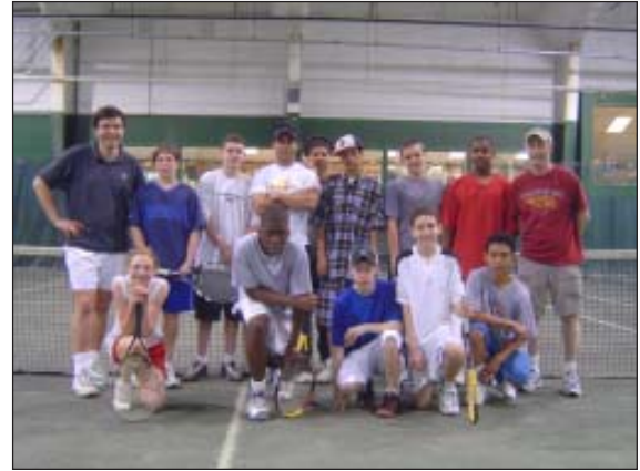
Tenacity Team and Staff with juniors and staff from the Westboro Tennis and Swim Club

This spring, Tenacity students from all three ASEP sites—the Boston Athletic Club, Harvard University and the Reggie Lewis Center—played in organized matches against each other. For many, it was their first taste of competitive tennis, and it turned out to be addictive.