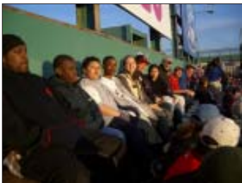
Tenacity students and staff take in a Sox game from the Dunkin' Dugout

Later in May, twelve current Tenacity students participated in an incredible learning experience: the 1 st Annual Tenacity Camping Trip . After receiving some very generous donations at our April 3 rd Gala Event, students spent two nights in New Hampshire's White Mountains as part of the Appalachian Mountain Club's A Mountain Classroom program. The group spent the first night at the new Highland Center in Crawford Notch. The next morning, campers and staffers woke up, geared up, and started hiking to the AMC's Mizpah Hut, a wilderness lodging on Mt. Pierce. The weekend was full of team-building and leadership activities, as well as instruction about ecology and the environment. Thanks again to all the people who supported this effort and made this once in a lifetime trip possible.